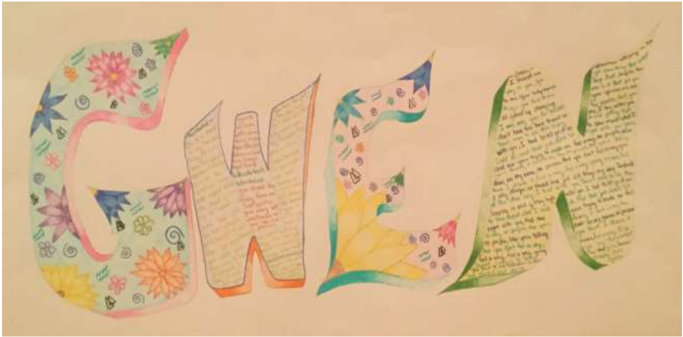
Gwen Goracke 1 pt Perspective Name