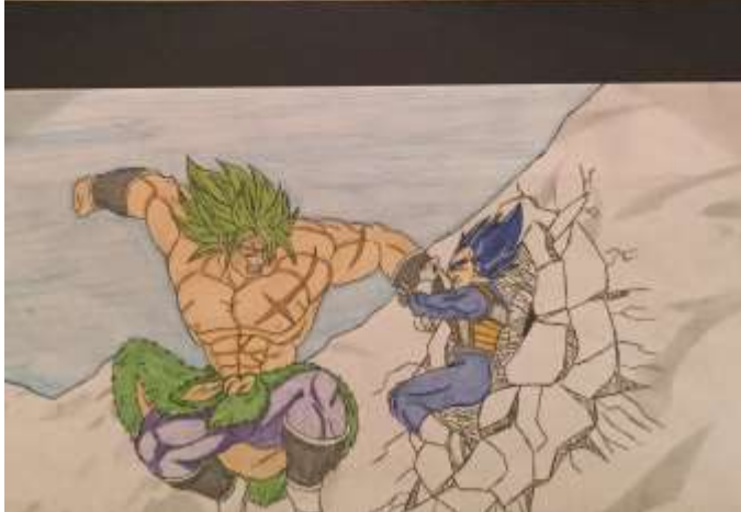
Steven Plager Two Warriors