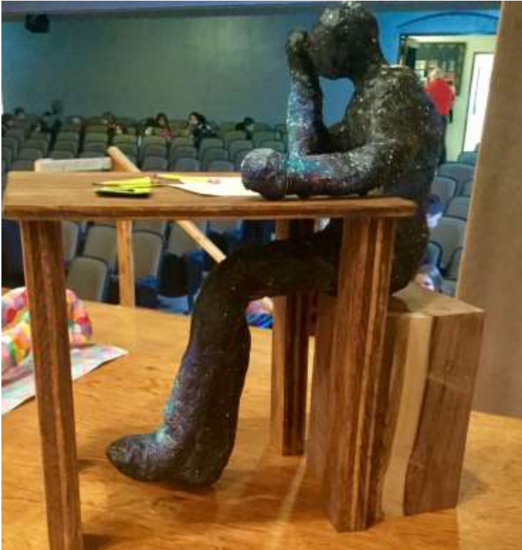
Saylor Rother An Infinity of Knowledge

We have attached photos of the 10 that will be on display from Johnson County Central. I have heard that these photos do not do them justice—they are very impressive to see in person! (These are also on the JCC website to view in color!)