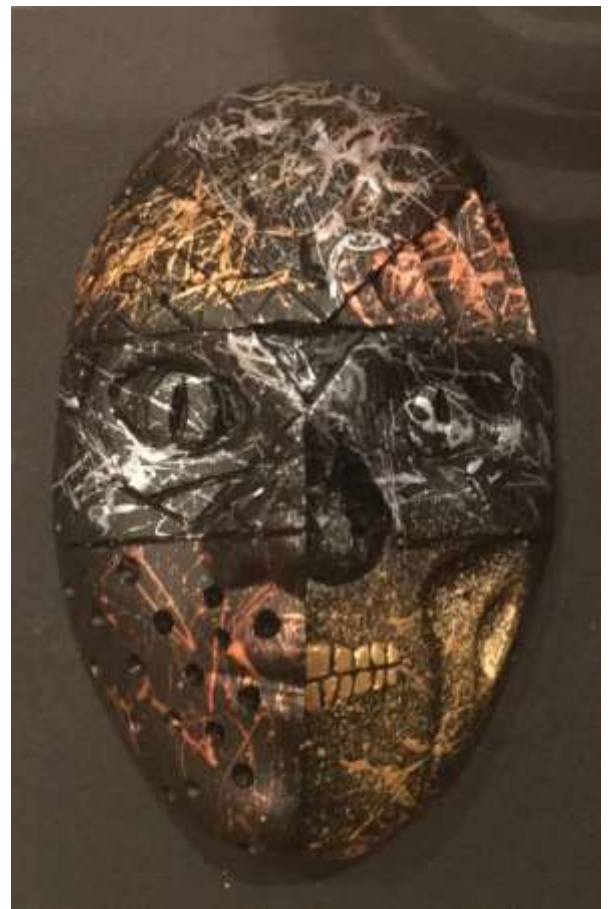
Autumn Nolte Metallic Mask