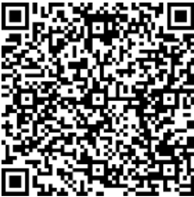
English Survey QR Code