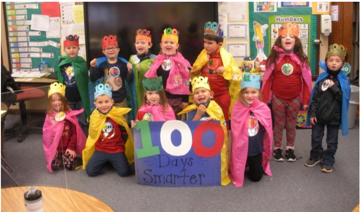
(Not pictured: Jacob Griess & Eli Turner)

We went on a scavenger hunt in our classroom to find 100 chocolate kisses with the numbers on them. We collected them all!